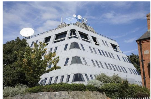
Figure 4: Met Éireann HQ in Glasnevin, Dublin

The forecast can come to you via many media; T.V., radio, newspaper, phone, the web or fax.