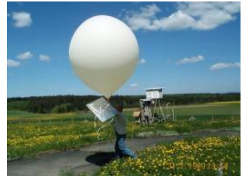
Figure 2: Weather balloon being launched

It carries various weather instruments, and travels high into the sky recording the state of the atmosphere at different levels.