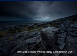
Irish Met Society Photography Competition 2011

The Irish Met Society is run by a dedicated committee of volunteers who give some of their free time to the organisation. To date 73 people have served on the committee. So far IMS has had 9