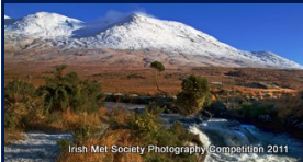
Irish Met Society Photography Competition 2011