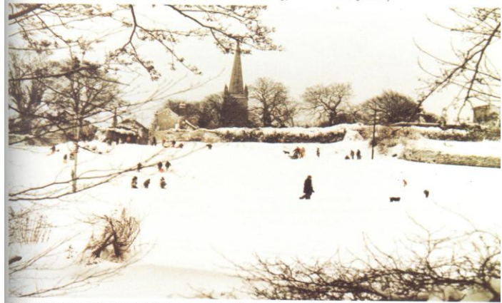
The exceptional snow of January 1982 (Photo: scene at Rathfarnham, county Dublin, by P.A. O'Dwyer)

There were scattered light snow showers in the period 5th-7th, 10th-12th and on the 17th, 22nd and 26th. Conditions were most severe in the Dublin area, at the Phoenix Park there were 8 consecutive days with mean daily temperatures less than 0° C.