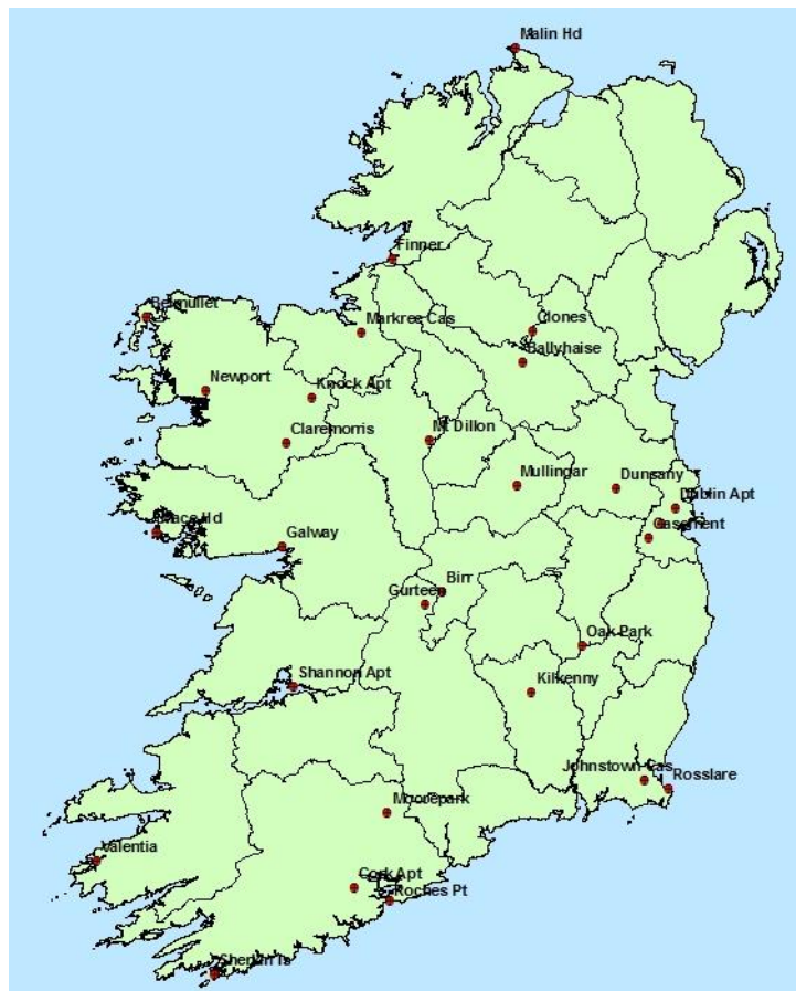
Map of weather stations in Ireland

This numbering system is a universal language understood by all people working in weather.