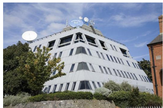
Met Éireann HQ in Glasnevin, Dublin

The next stage is to establish how the weather will develop.